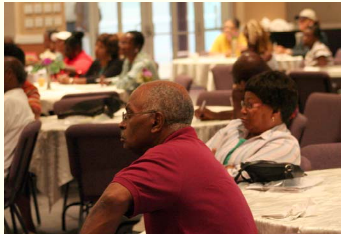
Residents attend Town-Hall Meeting