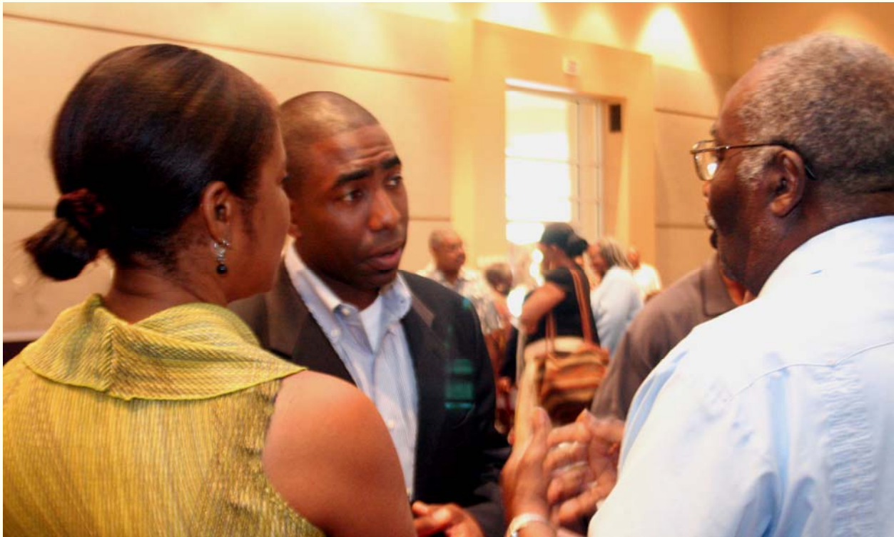
Commissioner May talks with District 5 constituents